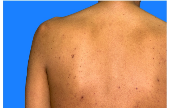
Figure 1 Telangiectasias were noted on the back and trunk.